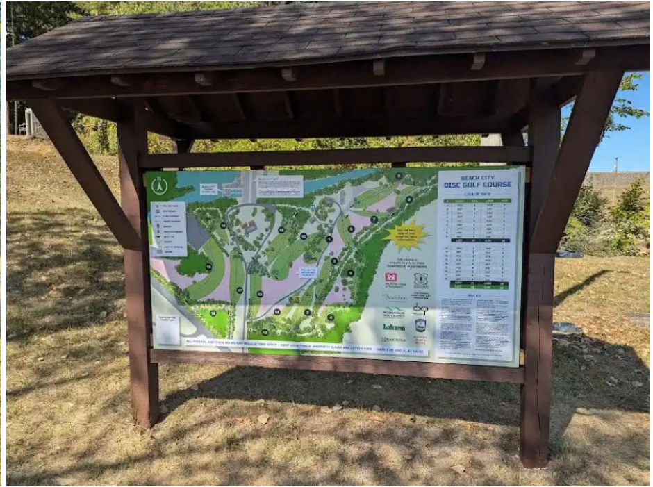
Kiosk before and after disc golf course sign installation.